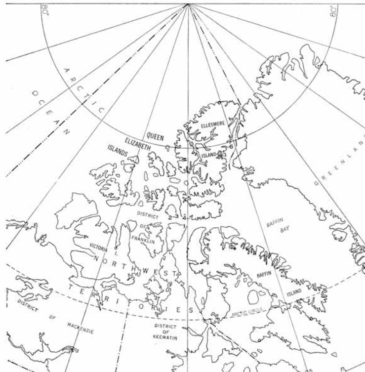
TEXT-FIG. 1. Late Silurian bryozoan localities Canadian Arctic Archipelago. 1. Cape Admiral M'Clintock, Somerset Island. 2. Rolute Bay area, Cornwallis Island. 3. Goodsir Creek, Cornwallis Island. 4. Radstock Bay, Devon Island. 5. Colin Archer Peninsula, Devon Island. 6. Darling Peninsula, Ellesmere Island.

1965 M. sp. cf. M. suprasilurica Hennig; Bolton, p. 12.