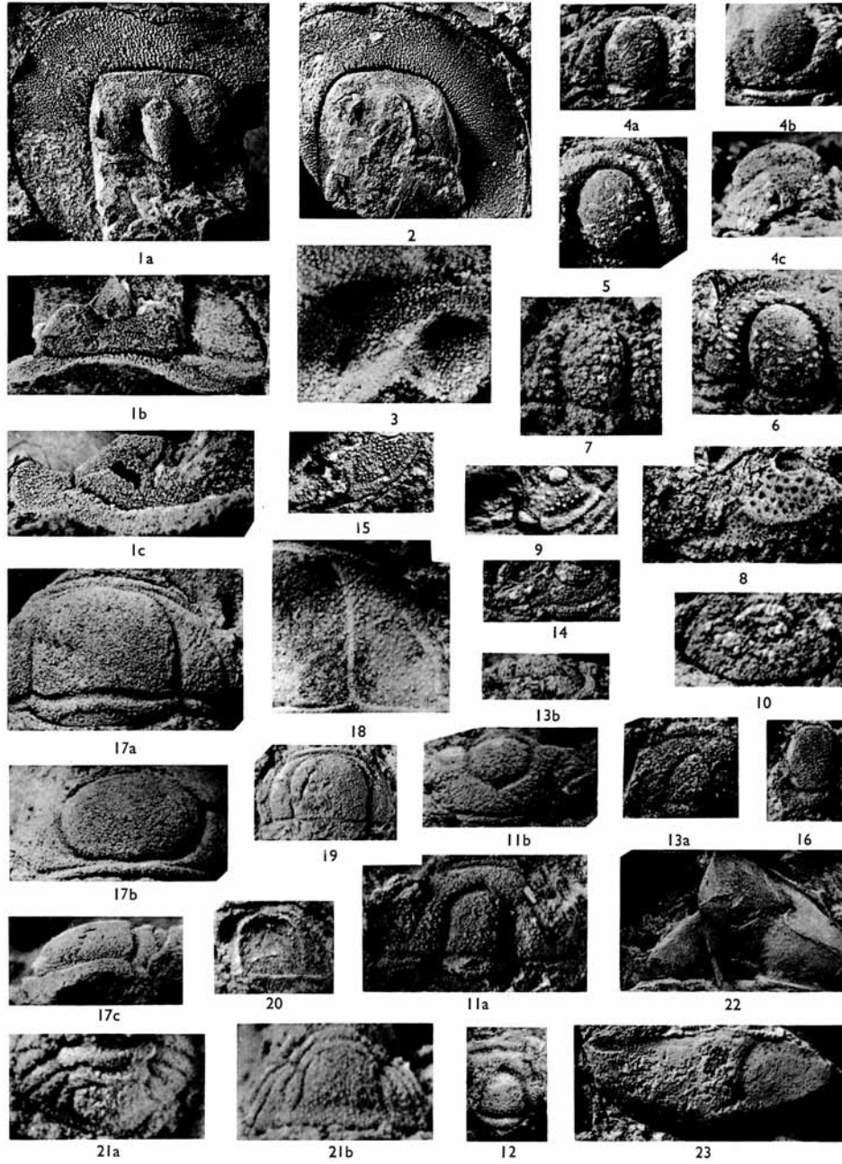
TRIPP, Girvan trilobites