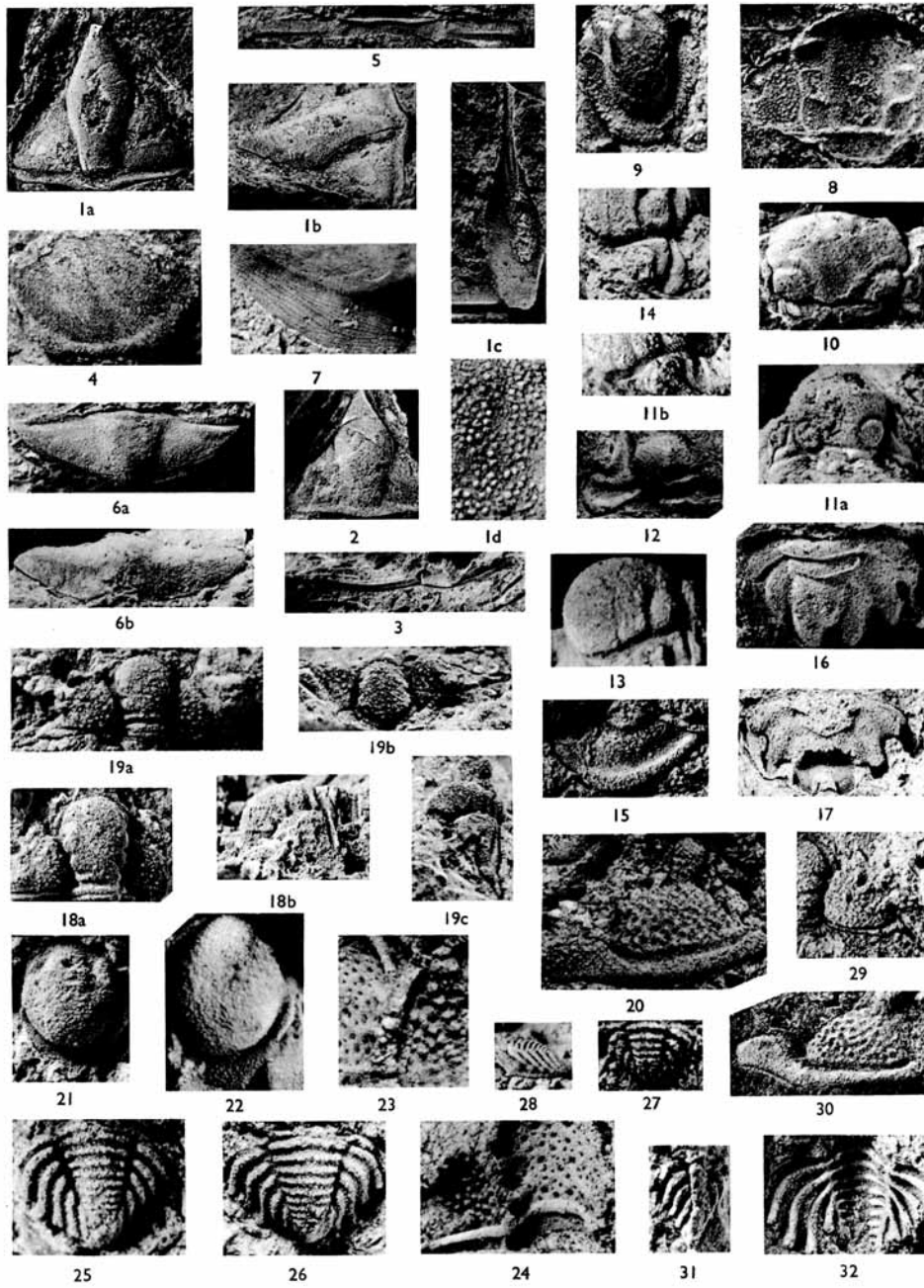
TRIPP, Girvan trilobites