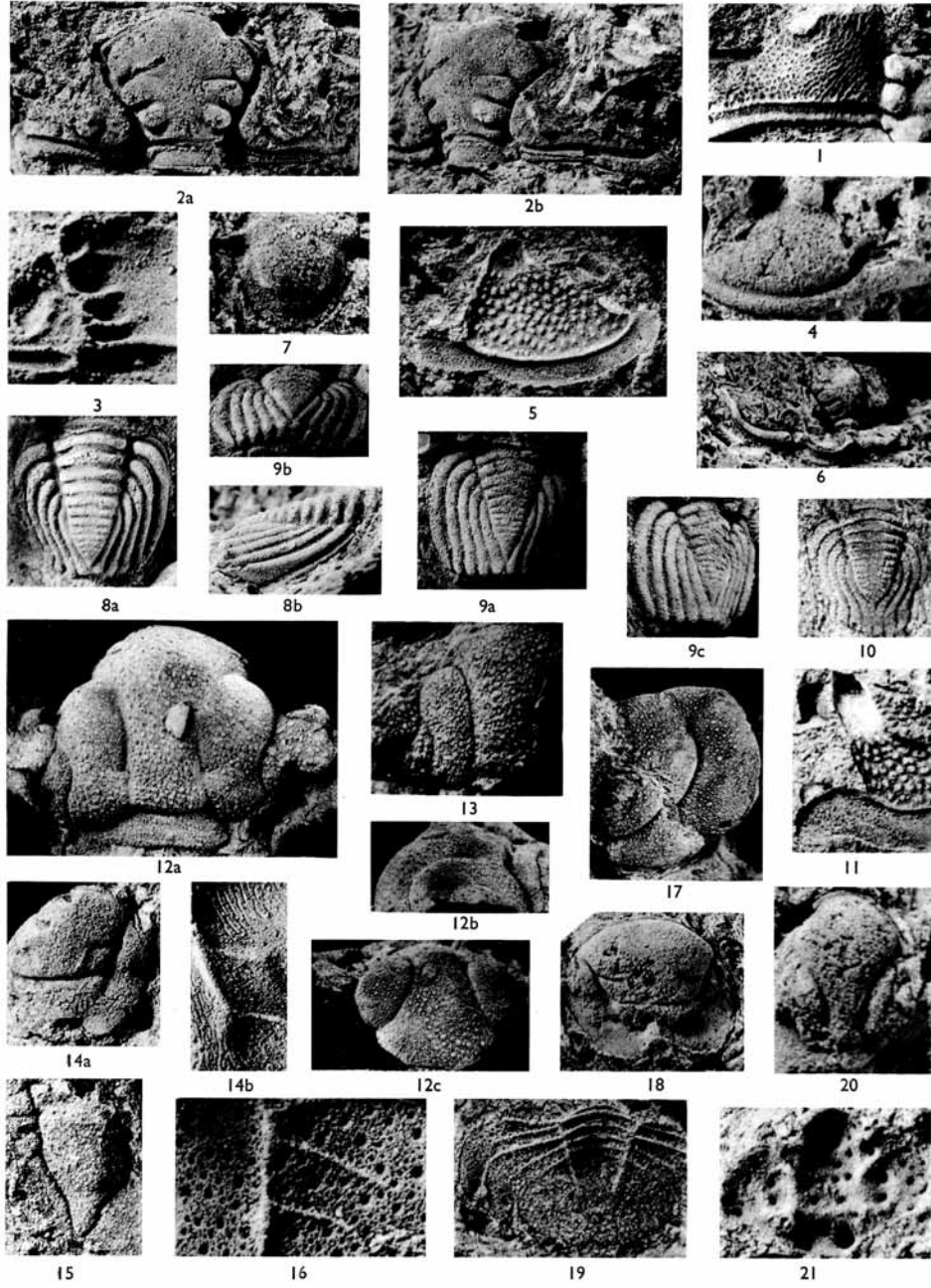
TRIPP, Girvan trilobites