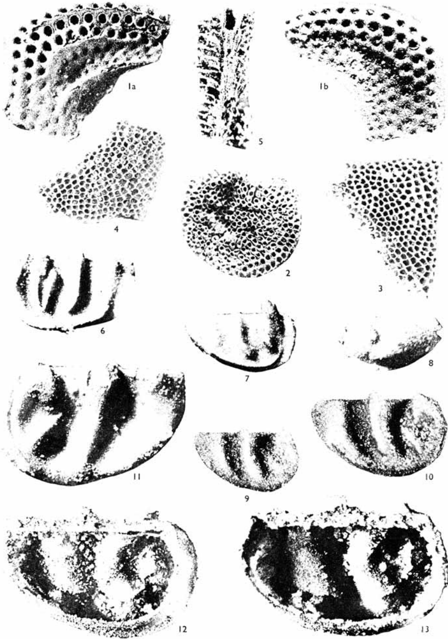
SPJELDNÆS, Silicified Ordovician fossils