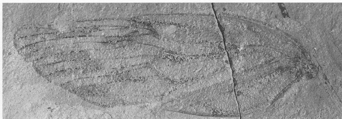
TEXT-FIG. 3. Holotype; specimen 9152 a; \times 5 .