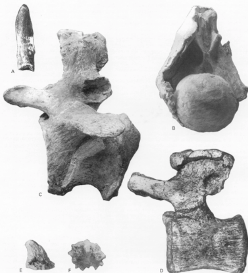
TEXT-FIG. 2. Malawisaurus dixeyi ; Malawi; Lupata Group, Early Cretaceous; referred material. A, MAL-176, isolated tooth, lingual view, \times 1.28 . B, No. 90-128; anterior caudal vertebra, posterior view, \times 0.28 . C, No. 89-79; anterior caudal vertebra, left lateral view, \times 0.46 . D, MAL-1; middle caudal vertebra, left lateral view, \times 0.56 . E-F, calcite pseudomorphs presumed to represent dermal ossicles, lateral and dorsal views, \times 1.3 .

Bellusaurus sui from the Middle Jurassic of China is reported to have procoelous anterior caudals and amphicoelous middle caudals (Dong 1990). We have not examined the material so comments must be based on the published English summary and illustrations. Bellusaurus appears to be primitive in having undivided neural spines on anterior dorsal and cervical vertebrae, in the narrow