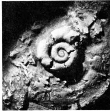
TEXT-FIG. 1. Innermost whorls of text-fig. 2, enlarged \times 7.5 , showing evolute whorls and two constrictions.

Description. The specimen consists of solid pyritized inner whorls, followed by crushed whorls for the remainder of the phragmocone, then a solid, mainly uncrushed body chamber. The innermost whorls (text-fig. 1) are preserved as a solid internal