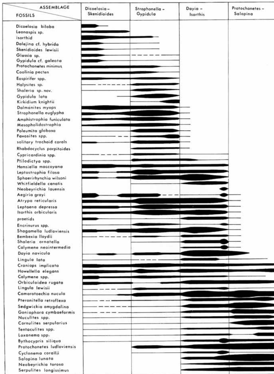
TEXT-FIG. 2. Range chart of benthonic fossils in the Ludlow rocks of the Welsh Borderland shelf facies: based on records from May Hill, Usk, Woolhope, Malvern, Aymestrey, Ludlow, Leintwardine, and Wenlock Edge (see p. 515 for discussion).