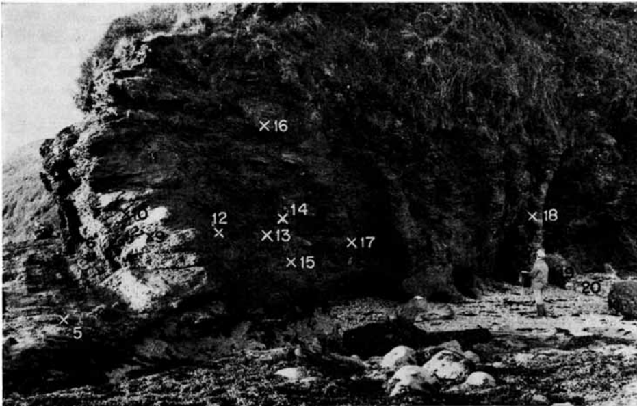
TEXT-FIG. 4. The Saltern Cove Goniatite Bed. Location of samples indicated.

3. Large-scale transportation of sediment. A sedimentary explanation means that the youngest elements in the Goniatite Bed, the limestone clasts, were reworked into older argillaceous sediments and that the whole was then transported en bloc into a muddy