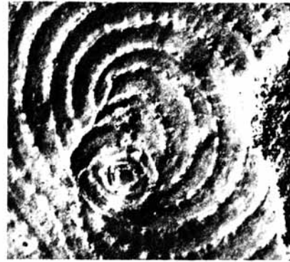
4 1 mm.