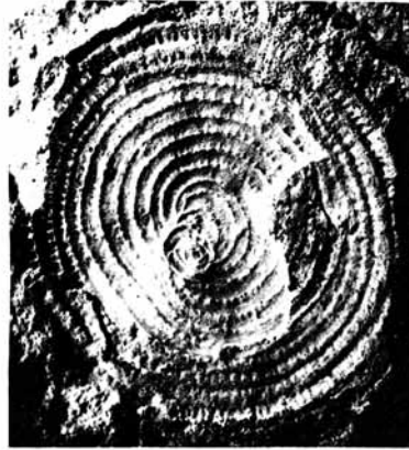
3 3 mm.