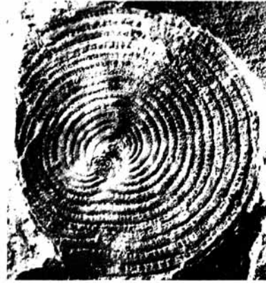
2 3 mm.