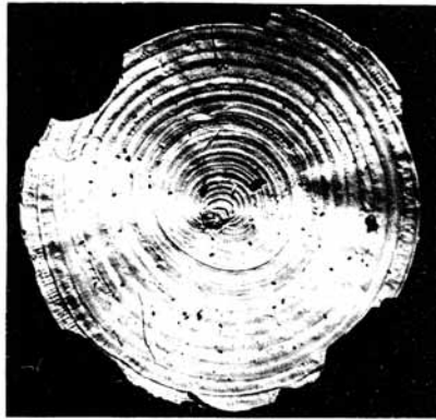
5 6 mm.