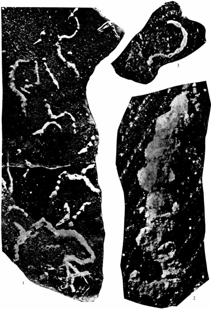
BARNARD, Mesozoic adherent foraminifera