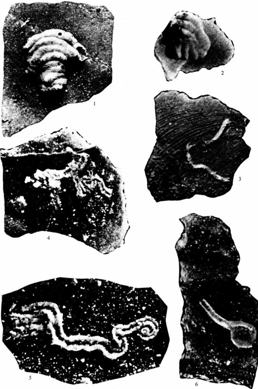
BARNARD, Mesozoic adherent foraminifera