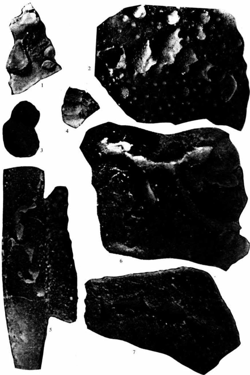
BARNARD, Mesozoic adherent foraminifera