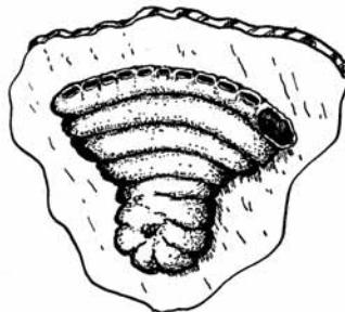
TEXT-FIG. 1. Arenonina cretacea gen. et sp. nov.

In the early stages of the test the aperture appears to be a longitudinal slit running the full length of the apertural face. The specimens which show this may, however, be damaged. In forms having fan-shaped later chambers the aperture consists of a single row of pores, each pore surrounded by a distinct smooth lip. The pores increase in size from the centre of the test towards the periphery. Each pore occurs at the top of a small crenulation of the apertural face.