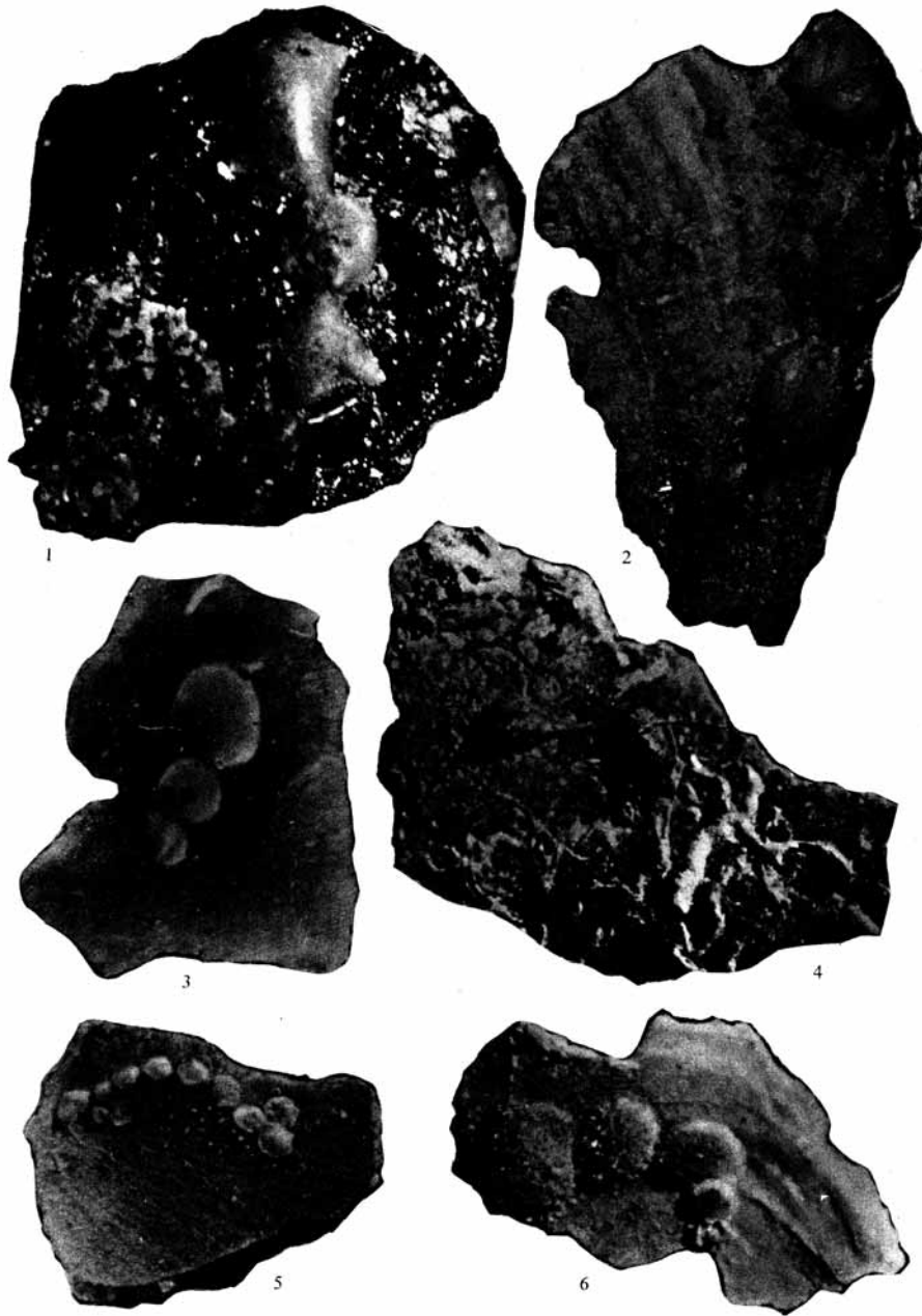
BARNARD, Mesozoic adherent foraminifera